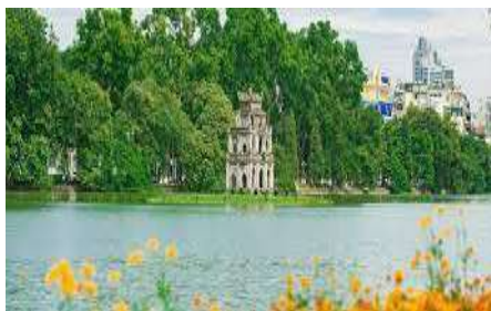
Hoan Kiem Lake