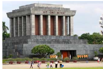
Ho Chi Minh Museum