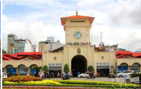
Ben Thanh Market