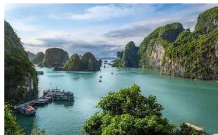
Ha Long Bay