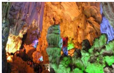
Paradise Palace cave