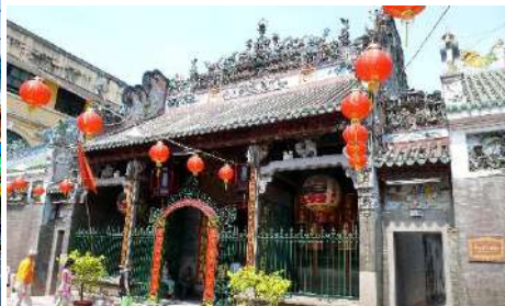
Thien Hau pagoda