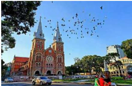
The Hundred Years Red Cathedral