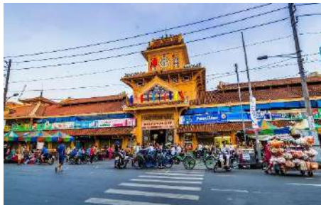
Binh Tay market

Distance Tan Son Nhat airport – Saigon Central: 7 - 8 km => 30 minute transfer